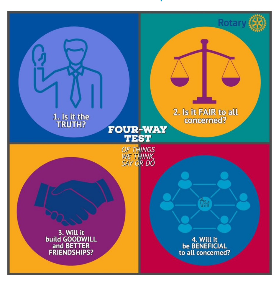
The Four-Way test